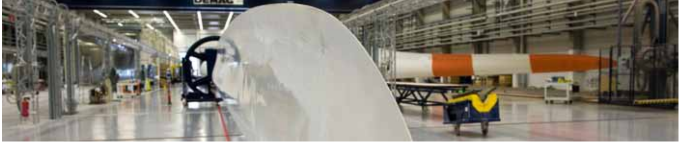
Rotor blade production at Vestas in Lauchhammer

With the increased decentralized production of electricity and heat as well as their consistently high efficiency, the use of micro (up to 250 kW) and small gas turbines (up to 1.5 MW) is increasing, e.g. in local and district heating networks, larger residential complexes, but also industrial processes. Due to the even higher efficiencies, there is great potential for the use of turbo fuel cells (micro gas turbines combined with high-temperature fuel cells) in the industrial sector.