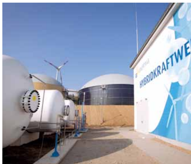
ENERTRAG hybrid power plant in Prenzlau