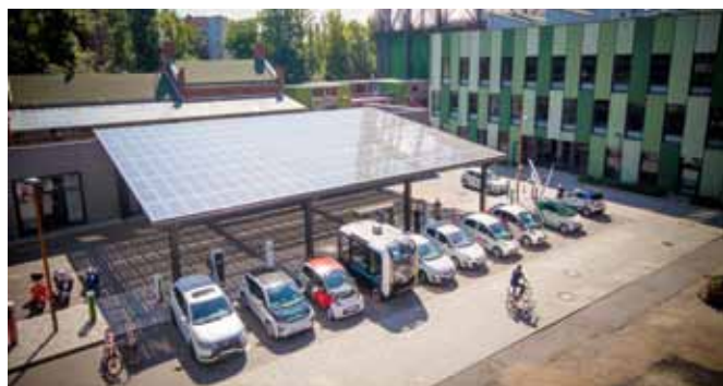
EUREF-Campus in Berlin

Brandenburg is one of the world's leading regions in the expansion and system integration of renewable energy. As a capital of digitization, Berlin is giving an important boost to the continuation of the energy transition, which is increasingly based on networking, sector coupling, and new business models.