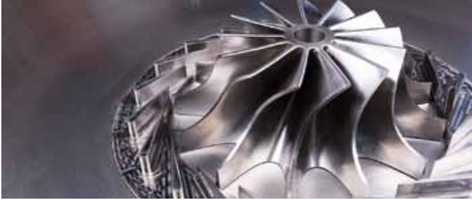
Micro gas turbine from Aurelia Turbines

was developed by the Berlin company Younicos, went into operation. The fully automatic system with 5 MW of lithium-ion storage stabilizes short-term fluctuations of the power line frequency with control power. Additional battery storage projects are running at the solar farm in Alt Daber and in the energy self-sufficient village of Feldheim in Brandenburg. The world's first hybrid power plant, which produces hydrogen as well as electricity and heat, is operated by ENERTRAG in Prenzlau. Since 2013, E.ON has been testing the power-to-gas technology in a pilot plant in Falkenhagen.