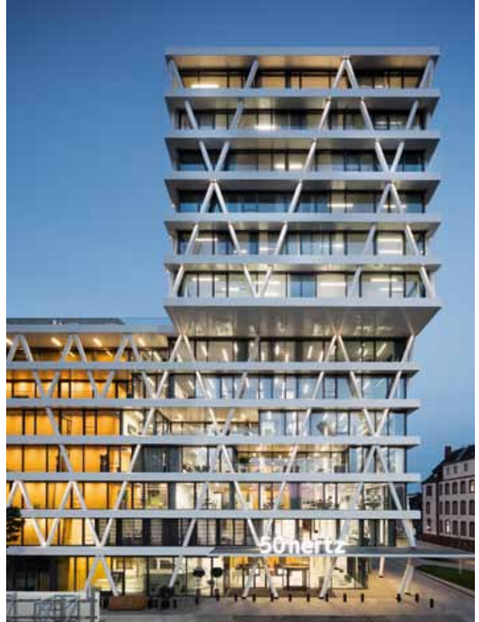
50Hertz headquarters in Berlin

All in all, an energy supply system is being set up in Berlin-Brandenburg with increasingly decentralized, fluctuating power feeders as well as smart control of generators and consumers. The safeguarding of this smart grid infrastructure is pursued through the development and deployment of innovative IT technologies and services and will increase the resilience of energy grids. Since 2017, the WindNODE consortium has been developing a digital infrastructure for the next stage of the energy transition.